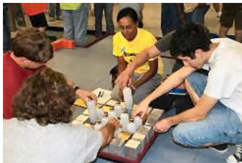
High school students work together at the DC BEST kick-off on September 15.

If you were at Research Park on Saturday, September 15, in the morning, you probably ran into the high school students at the DC BEST kick-off day. DC BEST (Denton County Boosting Engineering, Science, and Technology) is a nonprofit organization that organizes a robotic competition among middle and high schools. DC BEST provides free of charge to schools the supplies, the game field, the technical support and the overall environment where these school teams can compete in a robotics tournament. At the kick-off on Saturday, the rules of the upcoming robotics game were explained, the students got to see the game field, and supplies for the competition were given to the schools.