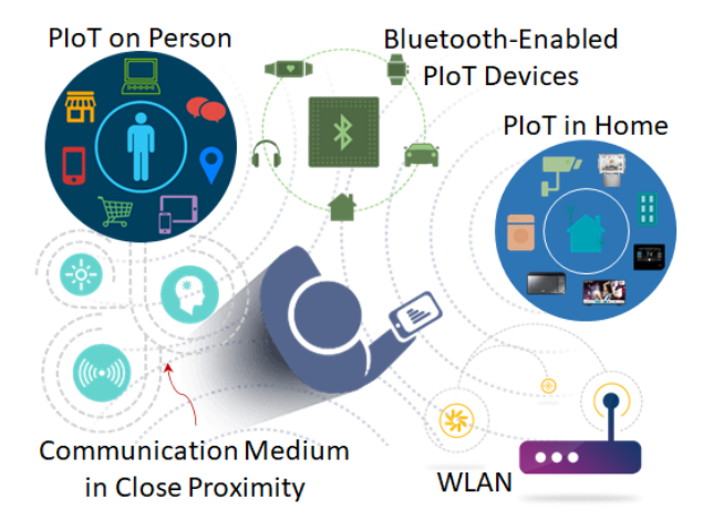
Fig. 1: An abstract view of PIoT networks.

high datarate wireless broadband, long and short-range communications. This technological progression has led to various applications relating to consumer goods. Nonetheless, when it comes to extreme short-range communications, as in the case of the PIoT network, the current mobile IoT standards or 5G standards, in a broad sense, do not support extreme short-range communication capabilities. Therefore, the PIoT network demands a framework that enables the seamless integration of PIoT into the 5G ecosystem.